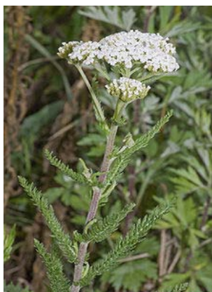
Fig 1: Achillea millefolium