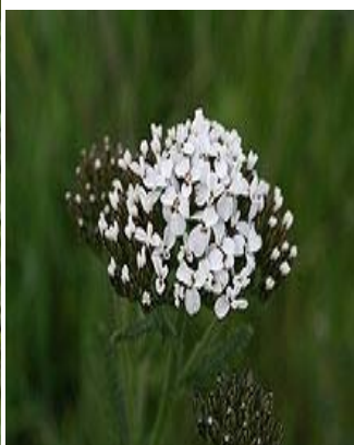
Fig 2: Budding